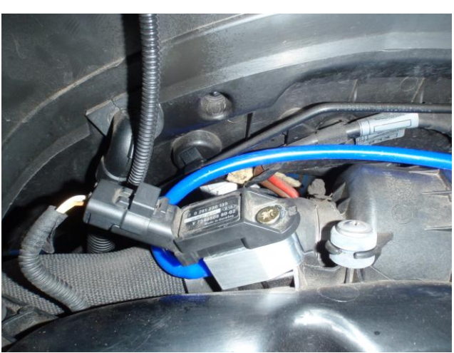
ENGINEERED FOR PERFORMANCE